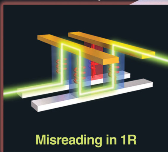
Misreading in 1R